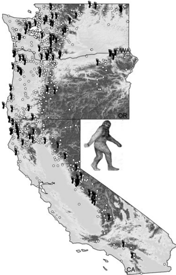
Figure 1 Map of Bigfoot encounters from Washington, Oregon and California used in the analyses. Points represent visual/auditory detection, and foot symbols represent coordinates where footprint data were available. Shading indicates topography, with lighter values representing lower elevations.

It is expected that species distributions are likely to be altered under global warming, and a number of studies have used environmental layers derived from climate-change models to project contemporary distributions into the future using ENMs (Hijmans & Graham, 2006; Pearson et al. , 2006; Loarie et al. , 2008). Despite potential weaknesses in such approaches (Pearson et al. , 2006), we were interested in examining the potential ramifications of climate change on hypothetical remnant Sasquatch populations and to predict how the frequency of sightings might change in the future. We projected ENMs generated from the WORLDCLIM data onto bioclimatic layers simulated for a doubling of atmospheric CO 2 ( http://www.diva-gis.org/climate.htm ). As expected for montane organisms, the model predicts Bigfoot to abandon